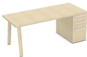
table desk, angled leg with single pedestal (CTDP)