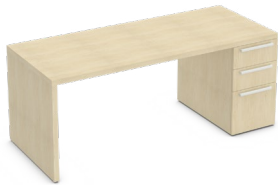
Desk, Single Pedestal (CD1S)

Depths: 24", 30", 36" Widths: 48" - 84" in 6" increments