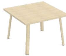
Square Table (CTTS)

Depths: 24", 30", 36" Widths: 72" - 84" in 6" increments