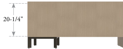
20-1/4" height Modesty for Elevated Pedestal models only