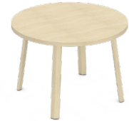
Round Table (CTTR)