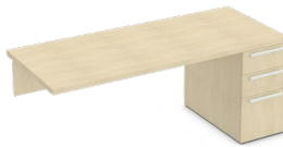
Run-Off, Pedestal, Flush to Credenza (CRHS)

Depths: 24", 30", 36" Widths: 72" - 84" in 6" increments