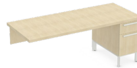
Run-Off, Elevated Pedestal, Flush to Credenza (CRHE)

Depths: 24", 30", 36" Widths: 60" - 84" in 6" increments