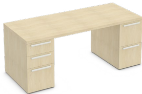
Desk, Double Pedestal (CD2S)

Depths: 24", 30", 36" Widths: 60" - 84" in 6" increments