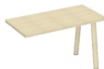
Run-Off, Leg, Overlap to Credenza (CROL)

Depths: 24", 30", 36" Widths: 60" - 84" in 6" increments