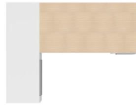
Run-Off for Low Credenza