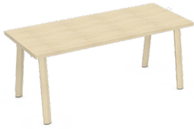
table desk, angled legs (CTDA)