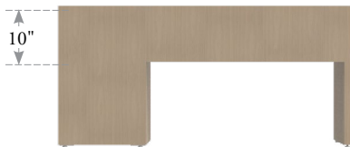
10" height Modesty