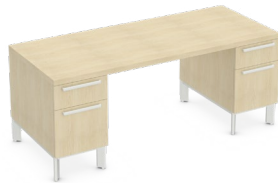
Desk, Double Pedestal, Elevated (CD2E)

Depths: 24", 30", 36" Widths: 72" - 84" in 6" increments