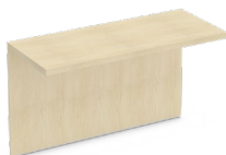
Bridge with Modesty (CBBR)

Depths: 24", 30", 36" Widths: 48" - 84" in 6" increments