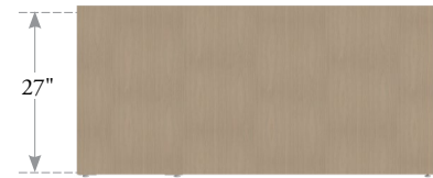
27" height Modesty