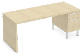
Desk, Single Pedestal, Elevated (CD1E)

Depths: 24", 30", 36" Widths: 60" - 84" in 6" increments