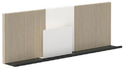
Lower Shelf with Dividers (C)