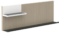
Lower Shelf with Tray (B)