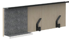
Hooks, Upper Shelf (L/R) (right shown)